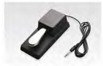
F-10H damper pedal