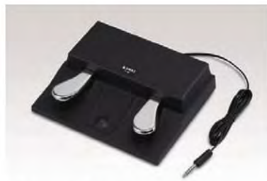
F-20 damper/soft pedal