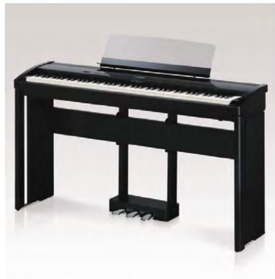
HM-4 designer stand, F-301 triple pedal (sold separately)