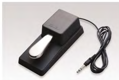
F-10H damper pedal