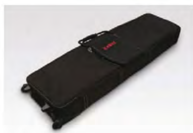
Gig-bag with castors